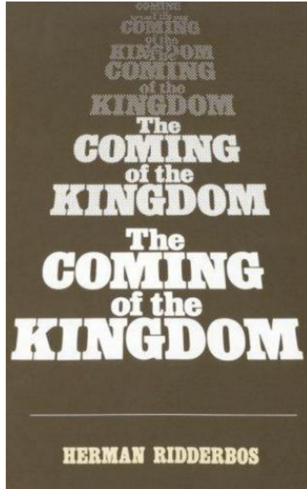
Herman Ridderbos Dutch Theologian 1909-2007